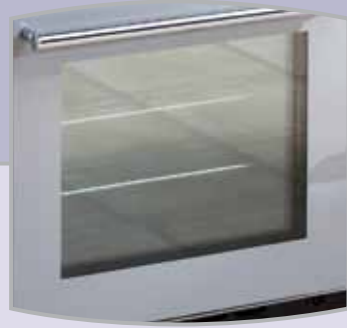
Fully programmable fan oven For even and faster cooking at lower temperatures