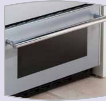
Storage compartment (bottom right) Versatile area to hold your pots and pans