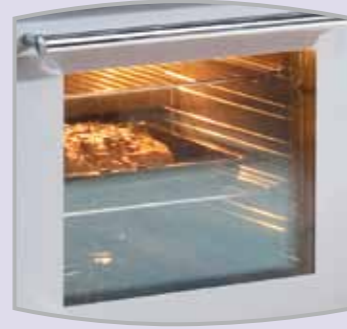
Large viewing window for both ovens For maximum flexibility and control