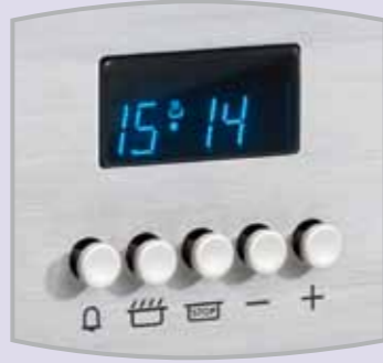
Fully programmable LED timer Easy to use programme settings, including Minute Minder and time display