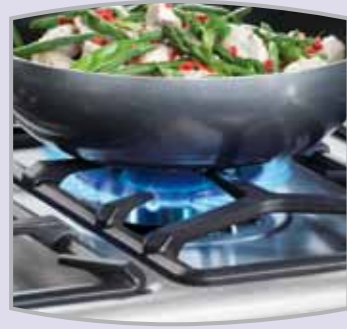
High output (3.6kW) wok burner A specially shaped pan support and high output gas burner. Ideal for cooking Chinese, Asian dishes or other stir fry dishes