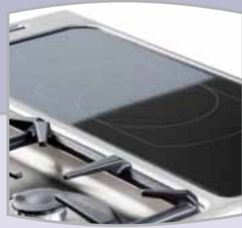
Ceramic warming zone Keep your food warm or ready to serve. It can also be used as a cooking zone for optimal flexibility