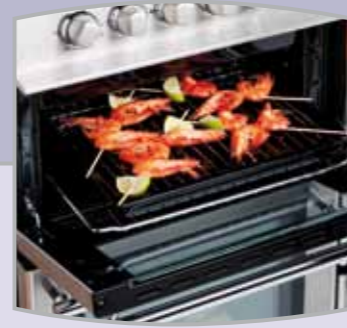
Fully variable dual grill A separate compartment ideal for traditional grilling