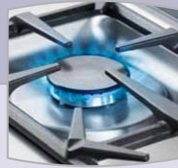
Cast iron pan supports Attractive and durable finish for hob cooking. Auto burner ignition with Flame Safety Device